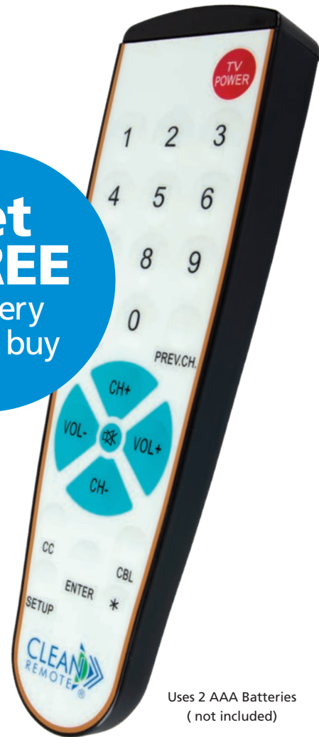
Uses 2 AAA Batteries (not included)