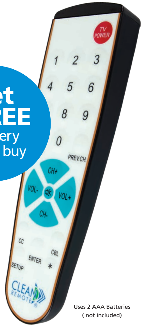
Uses 2 AAA Batteries (not included)